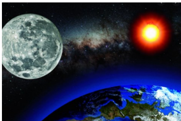
Moon and sun

In spring the plants begin to grow, and baby animals are born