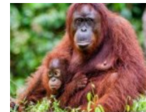
Animals that can live in hot places are meerkats, orangutans and alligators.