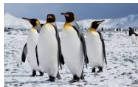
Animals that can live in cold places are polar bears, penguins and brown bears.