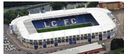
King Power football stadium