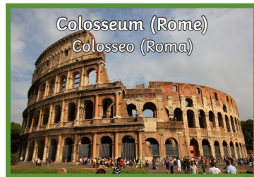
Colosseum (Rome) Colosseo (Roma)

Italy is a country in Europe. The capital city of Italy is Rome, which is found in the region of Lazio. Rome and Leicester both have large rivers running through them, the river Tiber and the river Soar. Italy has a sub-tropical climate and is warmer and drier than England. Famous landmarks, such as The Colosseum can also be found in Rome.