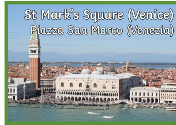
St Mark's Square (Venice) Piazza San Marco (Venezia)