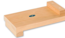
Set square/ engineers square