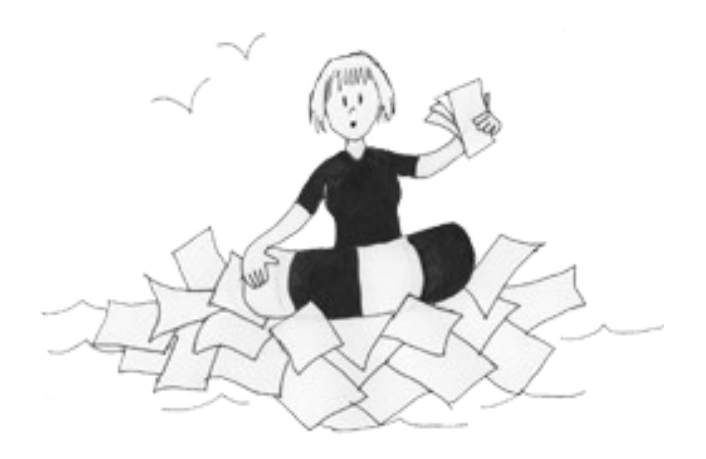
The process can seem scary and overwhelming, but there is help and advice available.

You can access the SEND Code of Practice online at www.gov.uk